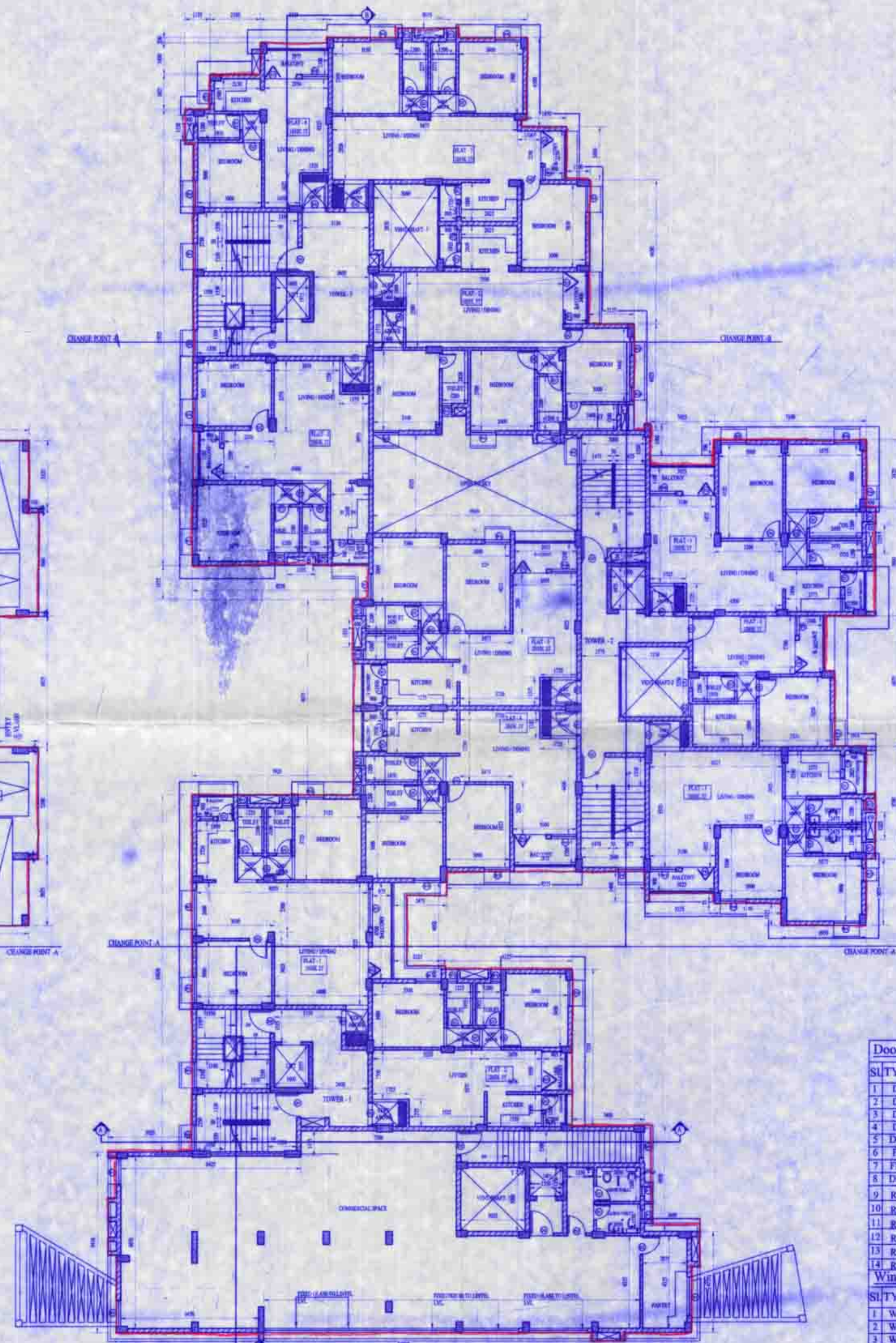
FIRST FLOOR SCALE 1:150